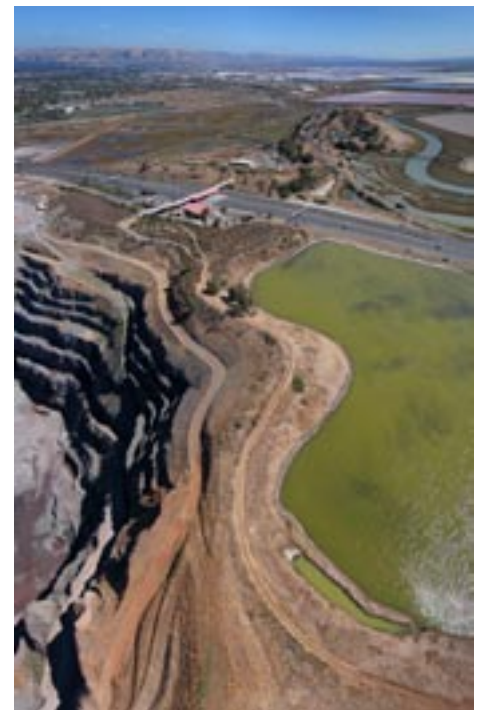
Panorama of the Red Hill Gravel Quarry with Arden Salt Works site in the distance (February 2008)

Landing at Dumbarton Point (37.512074°N, -122.107105°W) – At the eastern anchorage of the Dumbarton Highway bridges rest the ruins of an old landing. These old pilings and docks protrude into what is now a salt pond. This is perhaps one of the best-preserved landings in the South Bay and feels out of place on the edge of a shallow salt pond. However, a look back at the 1858 Coastal Survey shows that the location was once a marsh channel, labeled Beard's Creek, and that it was the major outlet of what is now called Fremont Slough. A 1931 map, based on aerial photographs, reveals that this was once the site of a smaller salt operation and, interestingly, that a railroad spur once branched from the Dumbarton Cutoff line, traveled over the Hetch Hetchy water pipeline on a bridge and terminated at the landing. The ruins may be viewed from the South Shoreline