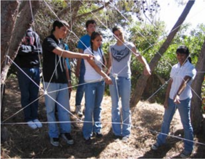
Teens working on a teambuilding exercise