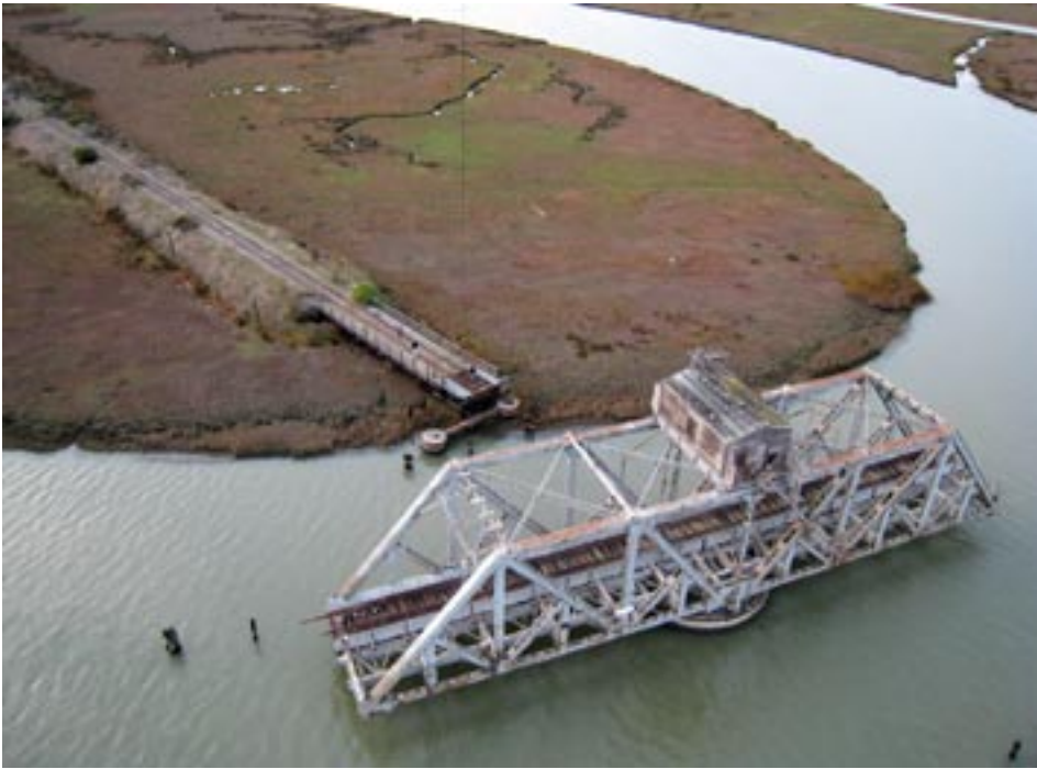
This swing bridge carried rail traffic on the Dumbarton Cutoff line across Fremont Slough (November 2006)

Trail, just south of the Dumbarton Fishing Pier. I have not found anything written about this landing, its years of operation, or even its name.