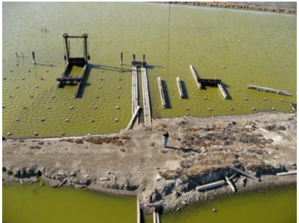
The ruins of a landing on what was once the bank of Beard's Creek (September 2006)

Meanwhile, the salt ponds changed as small operations were subsumed by