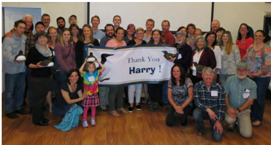
20th anniversary reunion.