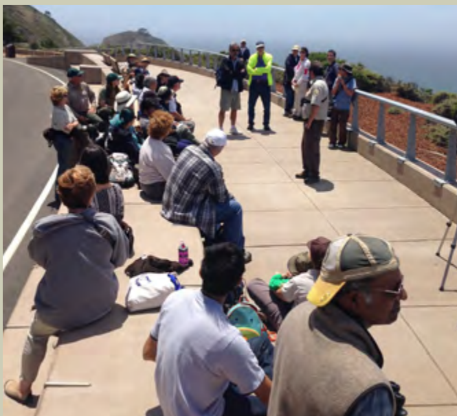
Volunteers on a special tour of Devil's Slide Rock Trail