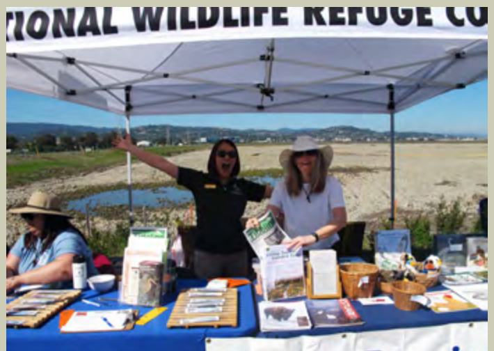
Tabling event at Bair Island Nature Day